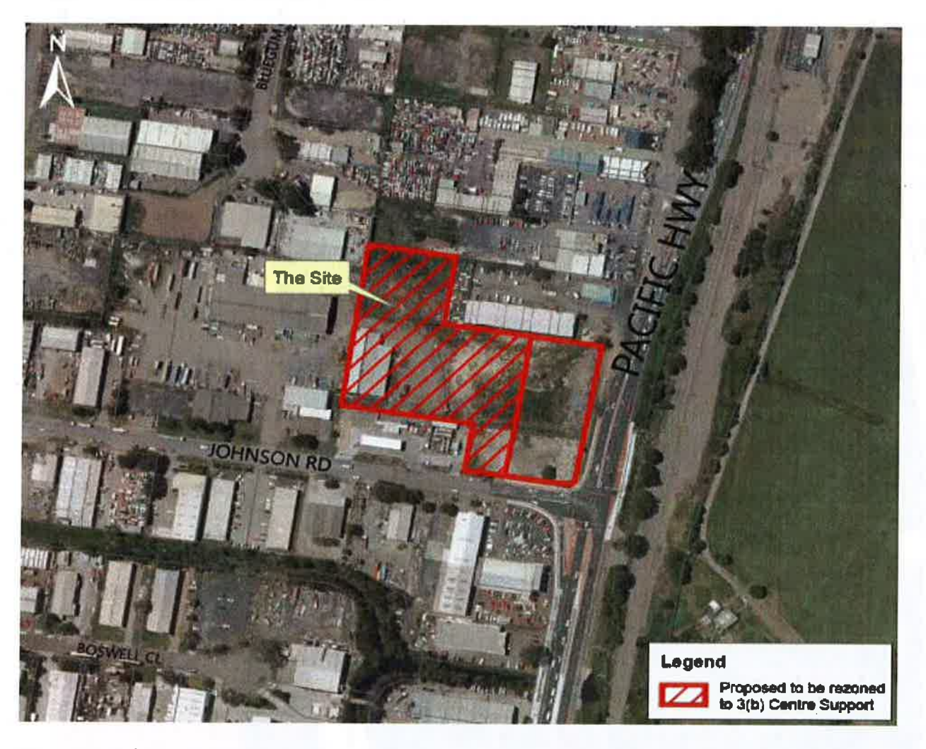
Figure 1: Site/Locality Plan

This Planning Proposal (PP) applies to a limited land holding on Tuggerah Straight known as Lot 1 DP 1135878 and Lot 32 DP 1095027, No. 186 Pacific Highway and No. 2A Johnson Road, Tuggerah, and depicted in Figure 1 below.