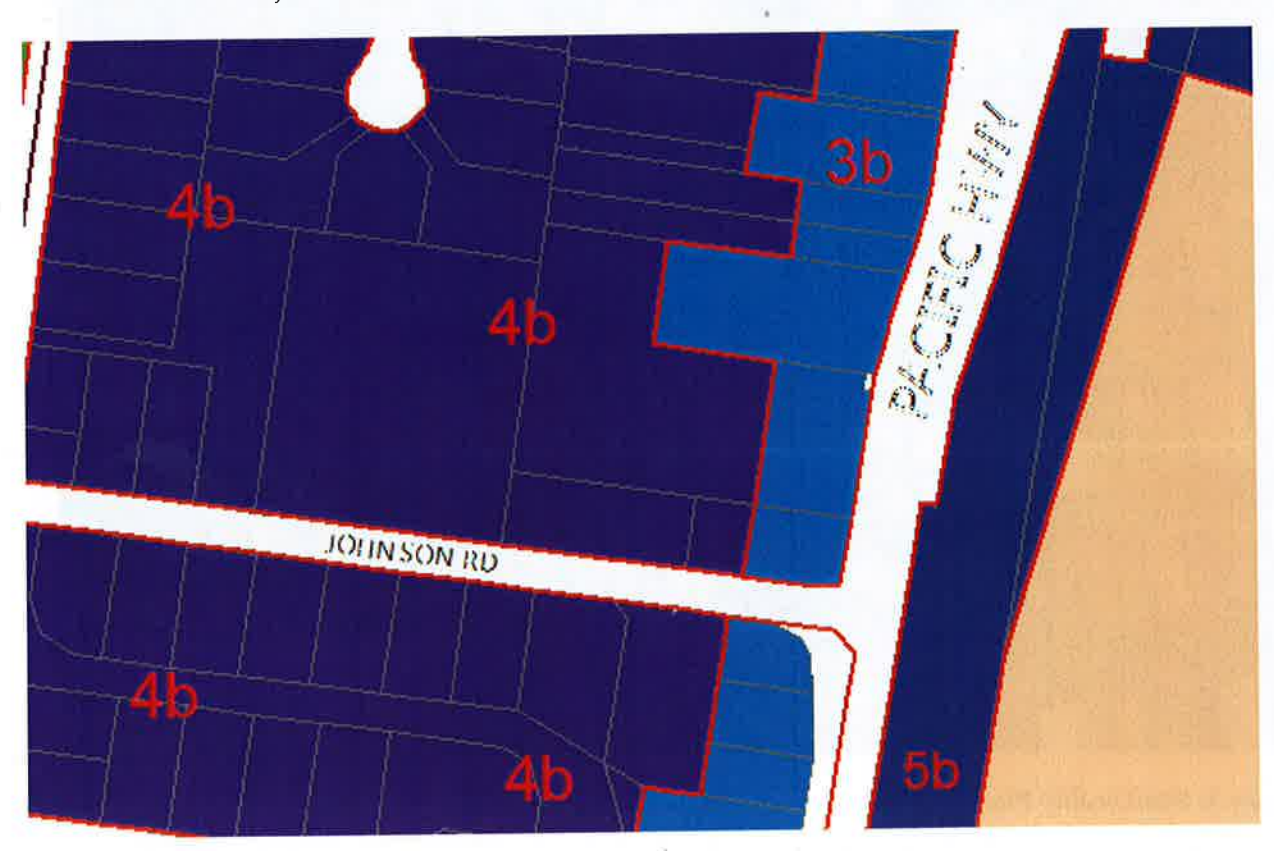
Figure 2: Site - Current Zones

The site is currently zoned 3(b) – Centre Support Zone and 4(b) Light Industrial Zone under the provisions of Wyong Local Environmental Plan (WLEP) 1991. A copy of Council's zoning extract with the subject allotments is shown below as Figure 2.